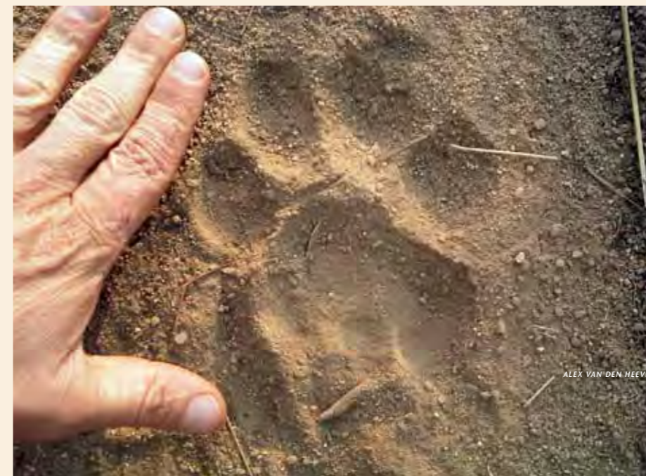
ALEX VAN DEN HEEVER

BELOW Following the tracks of an animal, such as this one left by a lion, in soft sand is relatively easy – until conditions change.