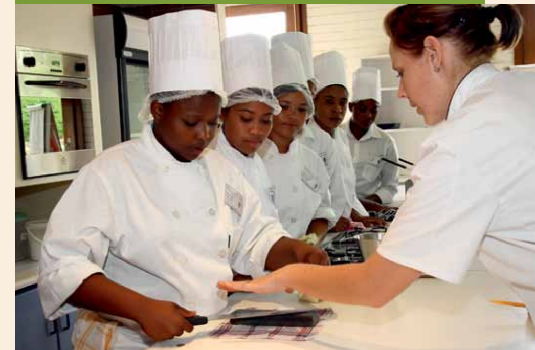
PEACE PARKS FOUNDATION

Students at the SA College for Tourism are put through their paces in four key areas: accommodation; culinary art; food and beverage operations; and reception services. Entrepreneurship and tourism also form part of the course.